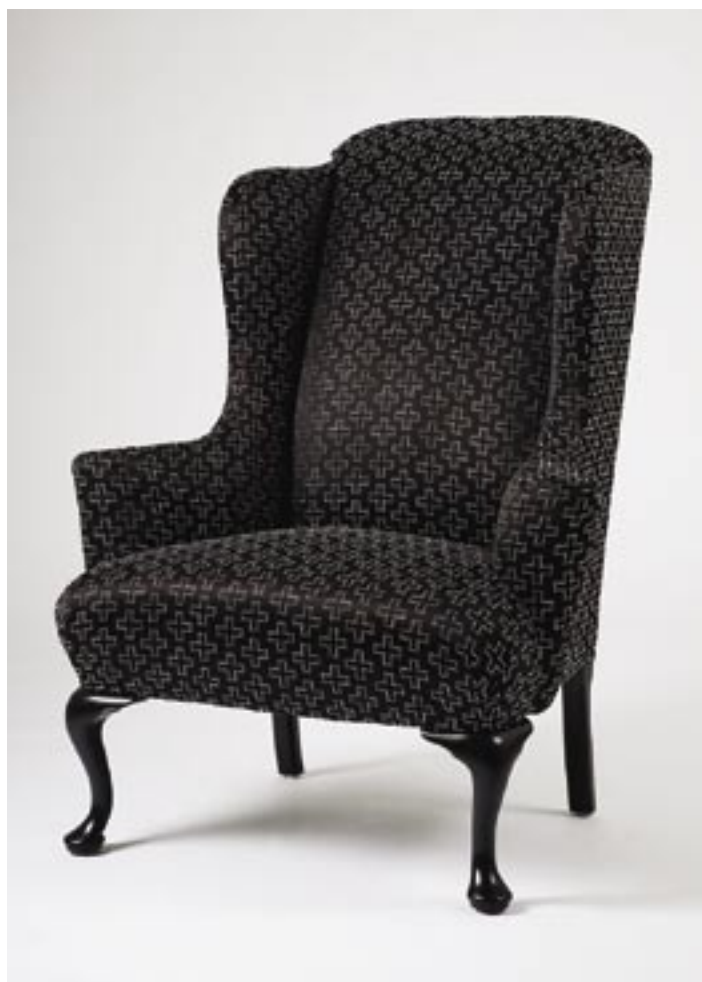
James Lear, BFA 08 Shine Chair (left)

Materials: Stainless Steel, Light Fixtures CRYSTALLIZED™ – Swarovski Elements: Crystal Glaze