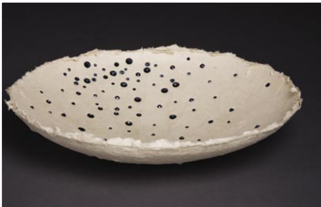
Chris Tolles, BFA 08 Crater Bowls (above)

For the first time, Swarovski and the world-renowned Rhode Island School of Design (RISD) have entered into a creative collaboration. With full artistic freedom given to students and unlimited access to the full product range of CRYSTALLIZED™ – Swarovski Elements, the results are outstanding: “Crystal Connection” manifests the true potential of crystal in the interior framework. The variety of work displayed ranges across the product sectors including seating, surfaces, lighting and flooring. Within the sectors themselves the depth of use in which the crystal has been applied is remarkable. The entire collection of the talented young designers was launched at the International Contemporary Furniture Fair in New York in May 2007 and is a true display of CRYSTALLIZED™ – Swarovski Elements and its impact on contemporary interiors.