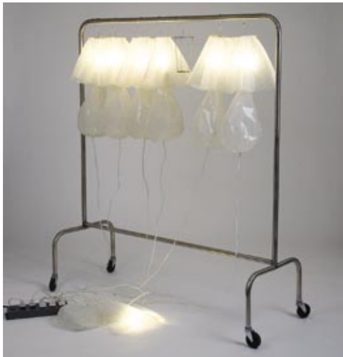
Ann Adams, MFA 07 Amorphous Lamps (above)

This installation of soft lights on an industrial coat hanger refers to the image of clothing. The soft lamps are constructed from Crystal Glaze, which is transparent and behaves similarly to fabric.